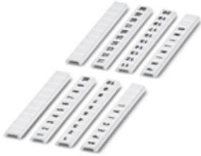
Zack marker strip flat, 10-section, horizontally labeled with the consecutive numbers: 21 ... 30, white

Please be informed that the data shown in this PDF Document is generated from our Online Catalog. Please find the complete data in the user's documentation. Our General Terms of Use for Downloads are valid ( http://phoenixcontact.com/download )